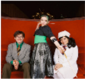
-Official Selection, Chicago Underground Film Festival