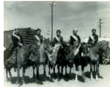
- Official Selection, Sundance Film Festival

An offbeat film about a musician at a crossroads in his career, made in the John Cassavettes tradition of natural dialogue and an improvised feel.