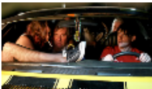
-Official Selection, Tribeca Film Festival -Tom Wilkinson stars.

This film will be preceded by the short film THE READER by Duncan Rogers, winner of the Home Grown Award for best short film at the Garden State Film Festival. * FILMMAKER WILL ATTEND POST-SCREENING Q&A