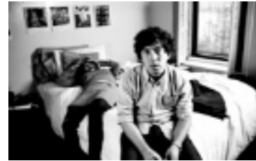
- Official Selection, Chicago International Film Festival.