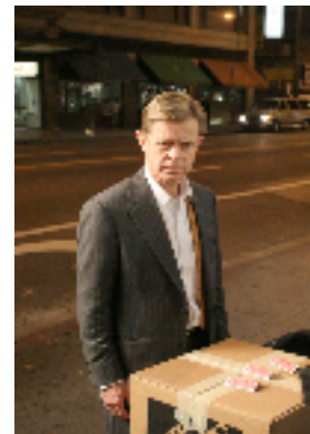
• Official Selections • Venice Film Festival, • Telluride Film Festival

This film will be preceded by the short documentary BLACK, WHITE, AND YELLOW by Nicole Koschmann. * FILMMAKER WILL ATTEND POST-SCREENING Q&A